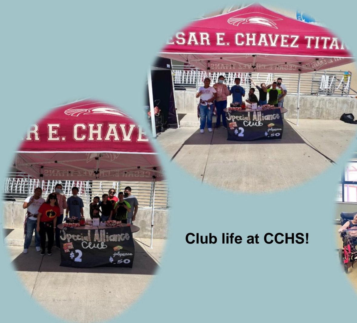
Club life at CCHS!